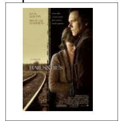
Movie Discussion February 2, 7:30 pm