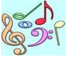
Musicale– March 1, 2 pm